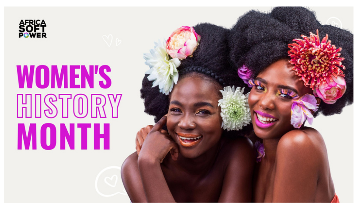
From March 1st - March 31st, Women's History Month is a celebration of the often-overlooked contributions of women to history, culture, science, and society in general.