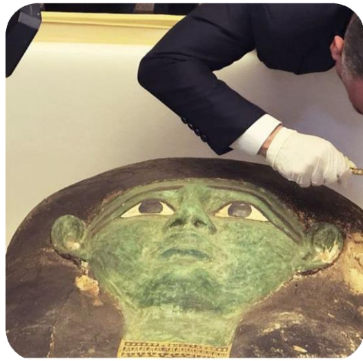
Egypt recovers 2,700 year old sarcophagus lid smuggled into the US