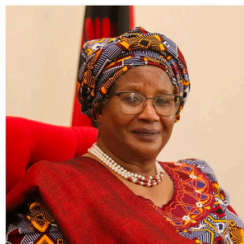
H.E. Dr. Joyce Banda Fmr. President of Malawi

Dear Friends & Family, The countdown is on! Only 16 days until the 2024 Africa Soft Power Summit kicks off in Kigali, Rwanda. And we're thrilled to unveil our first group of confirmed powerhouse speakers who will be gracing the stage!